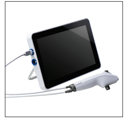
Ambu aScope 4 Broncho Slim and Ambu aView 2 Advance