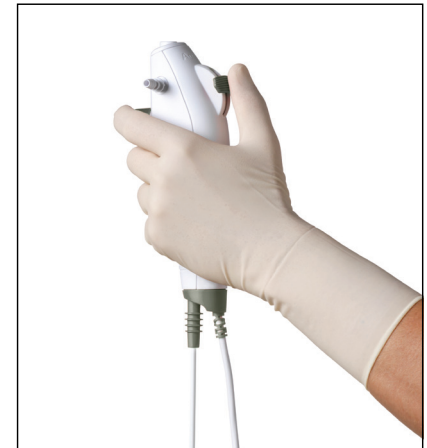
Ergonomic and lightweight handle designed to give you a firm and comfortable grip