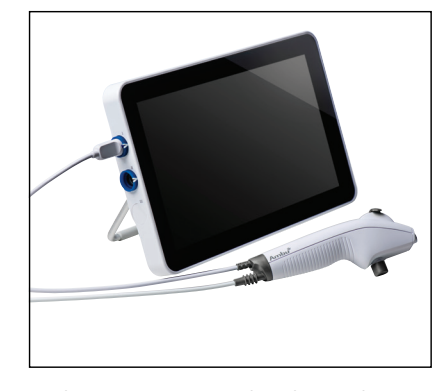
Ambu aScope 4 Broncho Slim and Ambu aView 2 Advance