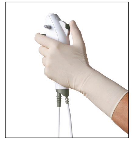
Ergonomic and lightweight handle designed to give you a firm and comfortable grip